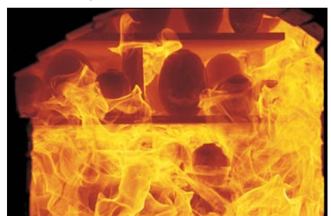
Pots firing in wood fired kiln- the tradition for the area for over 200 years

Some of the kilns take nearly a week to fire, stoking them with wood every 10 minutes or so. Volatile compounds including molten ash float and flash onto surfaces, building up and creating effects which can dramatically or subtly enhance a pot.