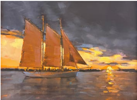
Work by Donald Weber

For further information check our SC Commercial Gallery listings, call the gallery at 843/805-8052 or visit ( www.rlsart.com ).